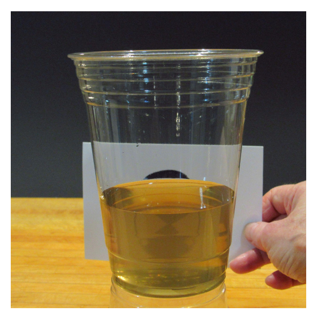
The Secchi disk cannot be seen, indicating this water is contaminated.

A <u>Secchi disk</u> is a simple tool used to check water clarity in a lake. You can use one with your filter: